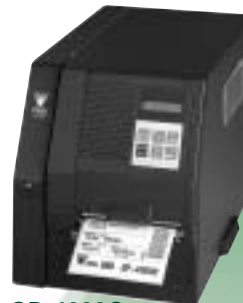
GP-4000C Command type On-line Bar Code Printer