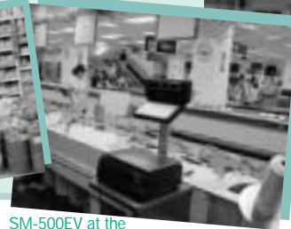
SM-500EV at the fish sales corner