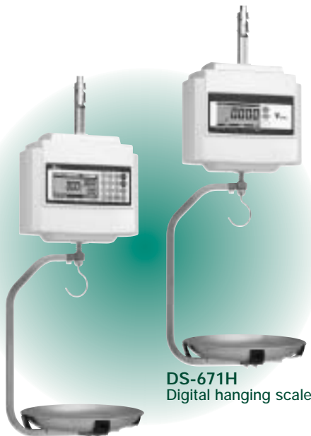
DS-671H Digital hanging scale