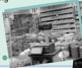
SM-500DP at the candy sales corner