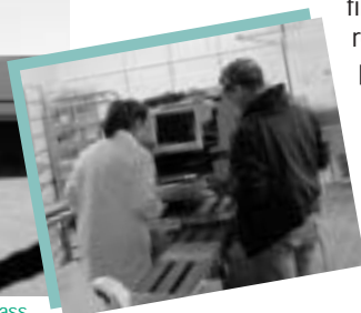
AW-3600AT in the meat room of a Shaws Markets store at Auburn, Maine