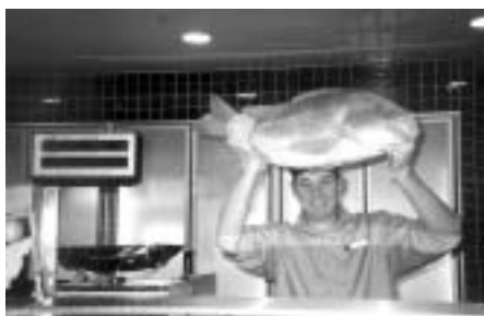
The range of fresh food, such as seafood, caters to customers' needs. The operator is holding a beautiful Red Emperor Fish.