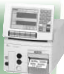
GP-460R Stand alone type