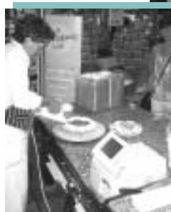
DP-90 in operation at a Albert Heijn store