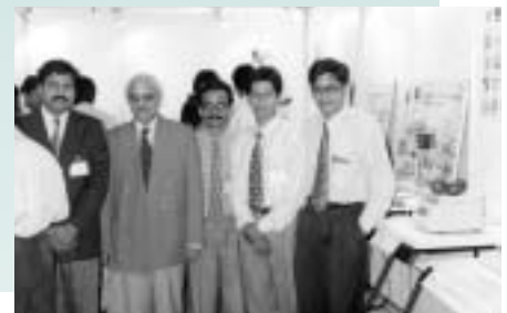
Essae-Teraoka's marketing team at an exhibition