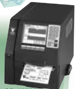
GP-4000A Stand alone type GP-4000A offers a complete solution for off-line applications