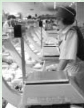
SM-80SX's lined-up at Bishkek

With the expertise of Service Plus in the retail markets, DIGI products have been successfully marketed since they started the business relationship in 1999, and