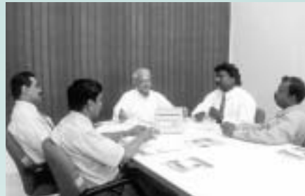
Marketing plan discussions for the launch of a new product

In the next issue of the DNB, No.45, we would like to continue to spotlight Essae-Teraoka Ltd. and will introduce their new R & D facility and expand on DIGI's presence in India.