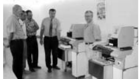
Carrin's professional sales and service team gathered at the AW-3600CP in the show room.