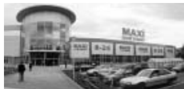
SM-80SX's are lined up in the modernized sales counter of the MAXi.

Computer Hardware Design SIA (CHD), DIGI distributor in Latvia received the order from RIMI, who opened their first hypermarket, named MAXi. A total of 16 units of SM-80SX's and a FX-3600XL/C were installed. The SM-80SX's are lined up in the modernized shop. RIMI is an Ahold operating company in Latvia.