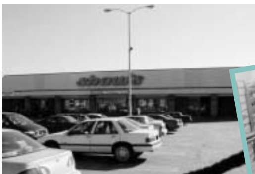
Shaws Markets store at Waymass, Massachusetts, where the first AW-3600AT was installed