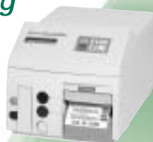
GP-460RC Command type

Powerful and ideal solution for on-demand printing for a variety of applications DIGI offers selection for the one that best meets your operation needs.