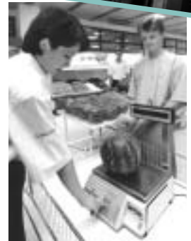
SM-80SX at the Seventh Continent