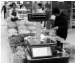
SM-500 at candy sales counter of Shen Zhen Wal-Mart Supercenter

200 units of SM-500's and DPS-90's are operated now. All new Wal-Mart supercenters in China are selecting DIGI right now. There were two key factors why the retail giant Wal-Mart selected DIGI. First was STE's perfect sales/service network in China, with their quick response to the customers' service call and second was the features and high quality of DIGI products with trouble-free operation.