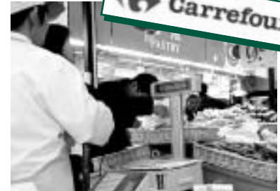
SM-300 at bread sales counter of Jin Qian Carrefour