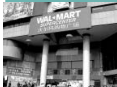
Fu Zhou Wal-Mart Supercenter