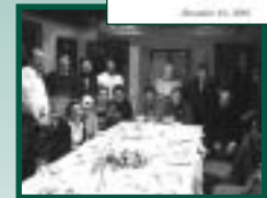
DIGI Award dinner party of Supersol