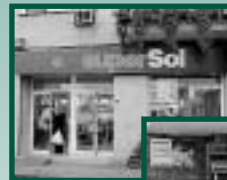
SM-90 at fish sales counter of Supersol