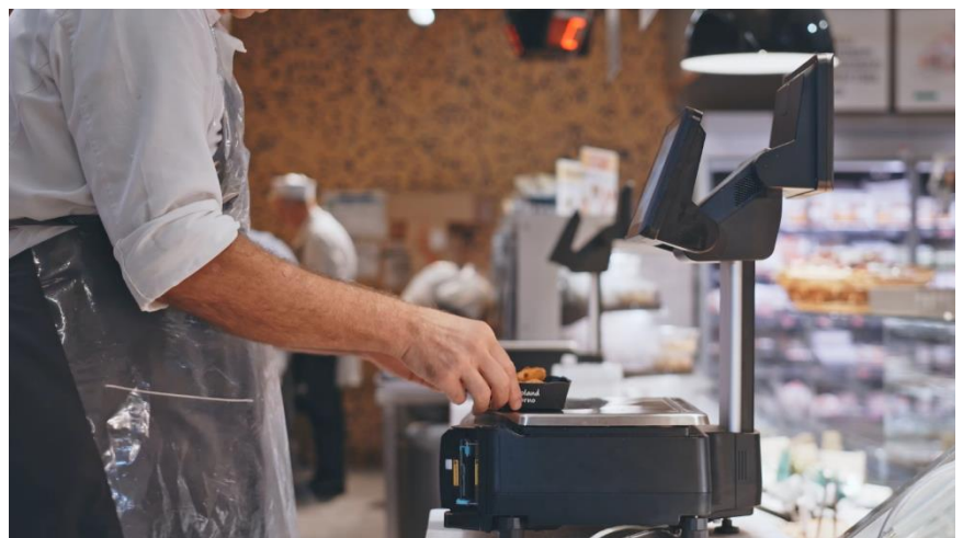
SM-5300 X EV at the Deli and Seafood section

“We wanted to minimise costs and time, and to have one single reference as supplier as well as for service support.”