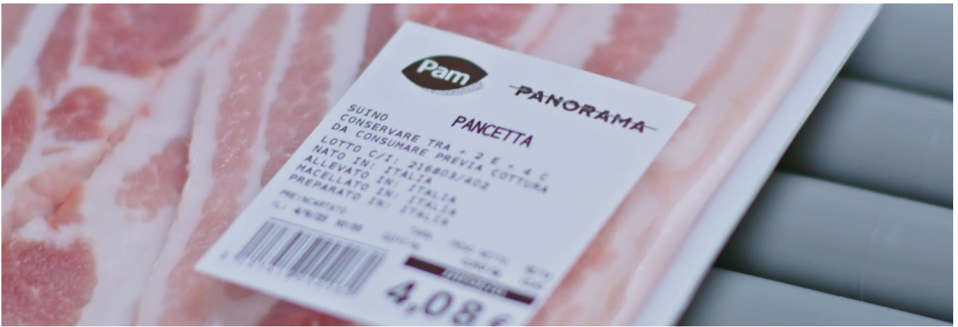
DIGI's linerless labels on various products