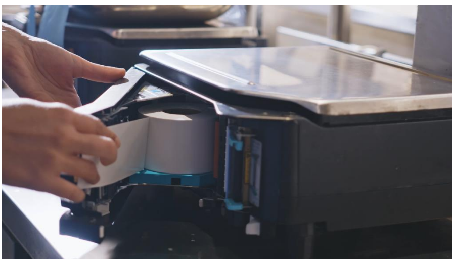
Label roll replacement is extremely easy with the SM-5300 X

“The Linerless solution is a winning one, both for reduction in label usage and easier roll replacement for operators.”