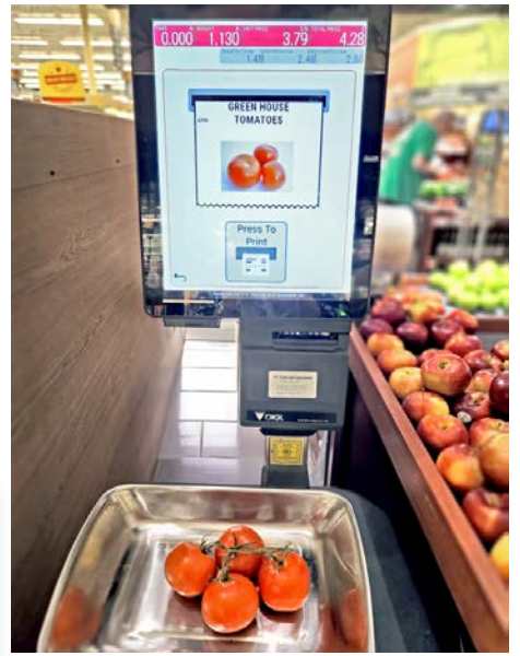
Green House Tomatoes on scale