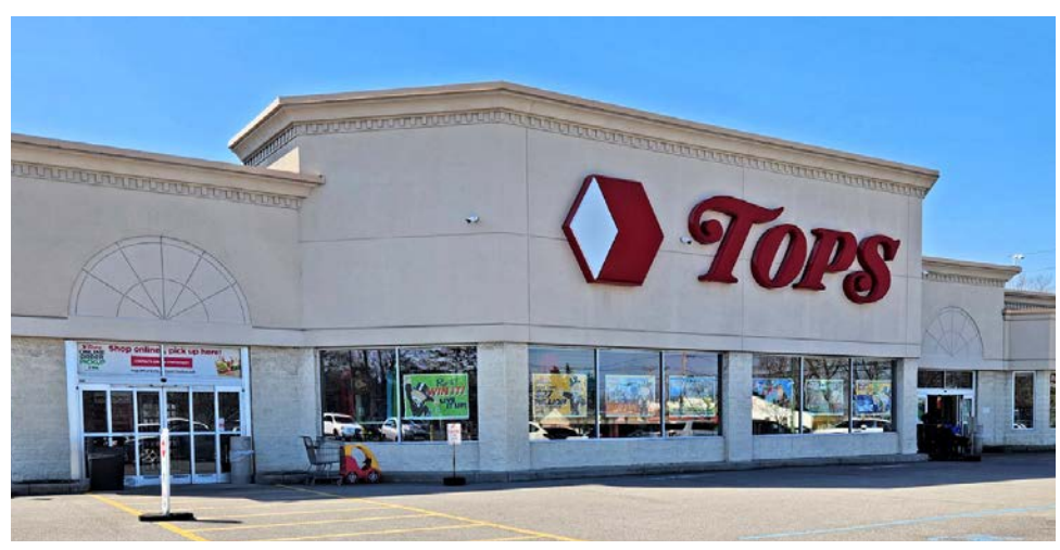
Front of Tops Market - Lewiston, NY