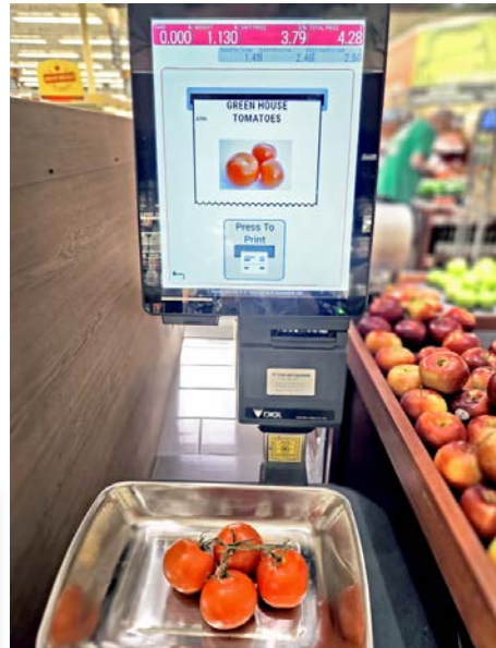
Green House Tomatoes on scale

“All customers really love the scale- the ease of use attracts the customers.”