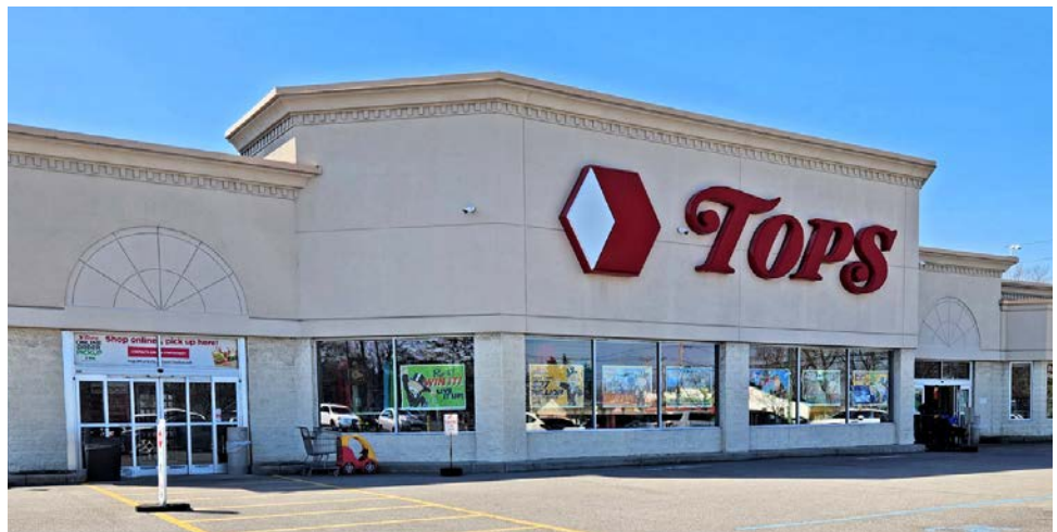
Front of Tops Market - Lewiston, NY

Founded in 1925 in Japan, DIGI has been in business for more than 97 years history. We have always been a leading company with retail solutions in the area of IT systems, checkout/POS, weighing and packaging. We made numerous world-first innovations and have been contributing to rationalization for retailers. DIGI sales and service network covers about 150 countries across the world. We value both globalization and localization to provide the best solutions with quality products and service where the customers are located in the world.