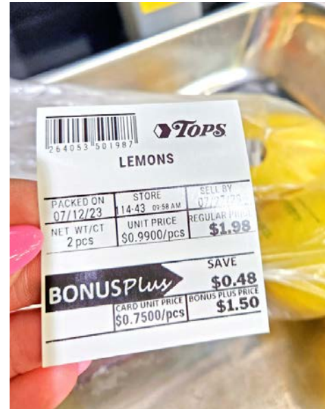
Checkout Label for Lemons