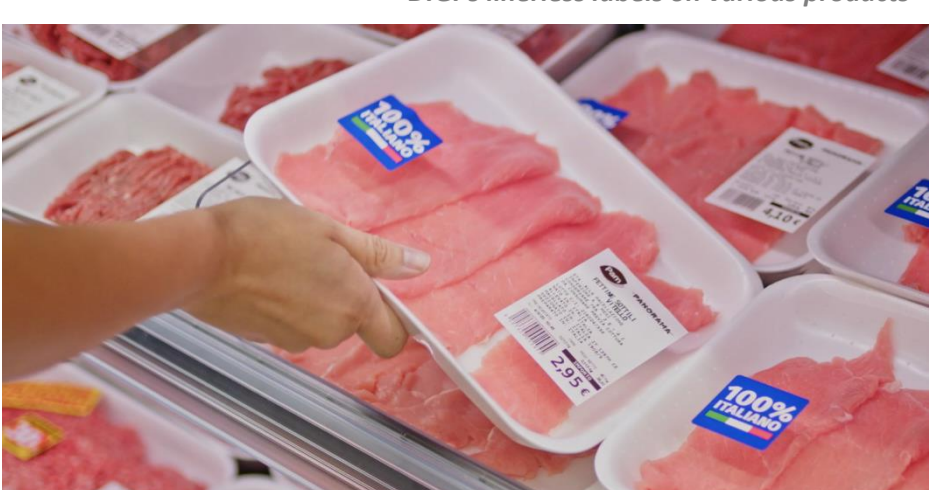
DIGI's linerless labels on various products

This allows the customer to keep downtime to a minimum and to manage all scales and wrappers with ease, while streamlining instore operations thanks to the new DIGI solutions that can be deployed on all devices, ultimately increasing the overall store productivity.