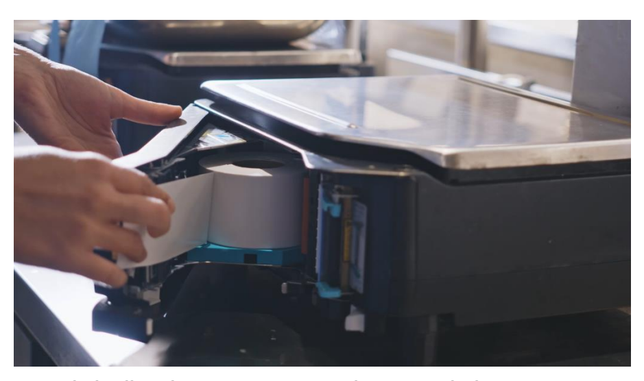
Label roll replacement is extremely easy with the SM-5300 X

"The Linerless solution is a winning one, both for reduction in label usage and easier roll replacement for operators."